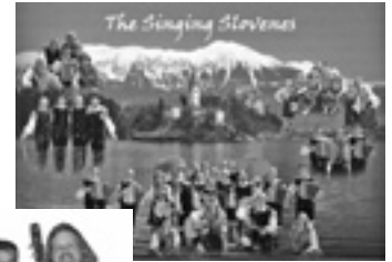
The Singing Slovenes